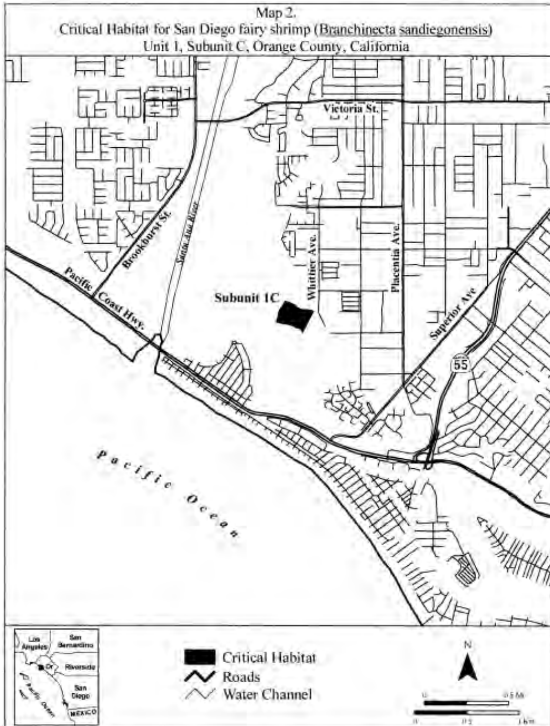
Map of 15-acre USFWS critical habitat area for San Diego fairy shrimp