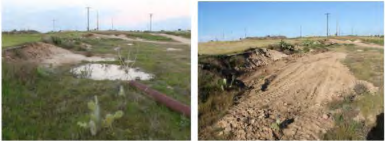
Vernal Pool/Seasonal Wetland #23 before and after disturbance

Special focused efforts will be needed in cases where the vernal pools/seasonal wetlands have been intentionally disturbed.