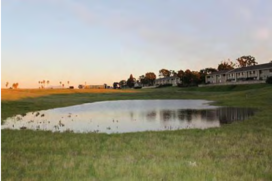
“Ticonderoga Pond” (aka vernal pool/seasonal wetland #31). Photo from 12/30/10.